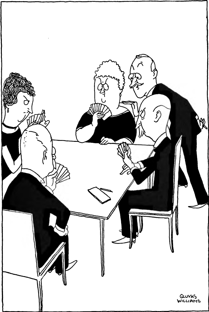
The watcher walks around the table, giving each hand a careful scrutiny.